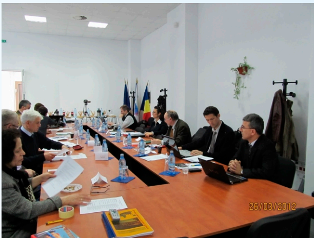
A picture from Inception meeting in Eforie

International Blue Crescent Relief and Development Foundation, Istanbul, Turkey