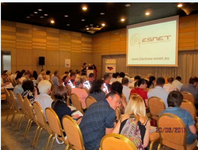
From the opening conference in Eforie