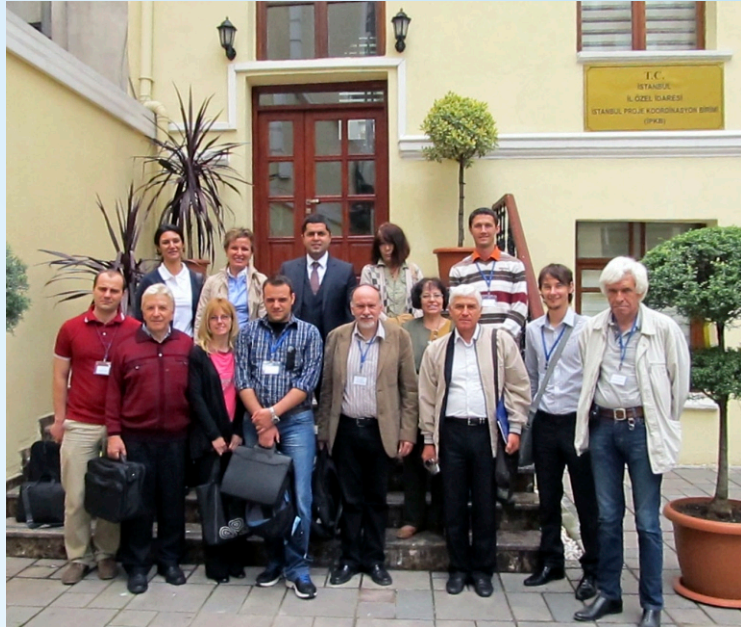
A group picture, with the team, all coordinators, from the country exchange visit in Turkey

The project through its objectives will contribute to increase capacity of emergency units to react to earthquake disasters.